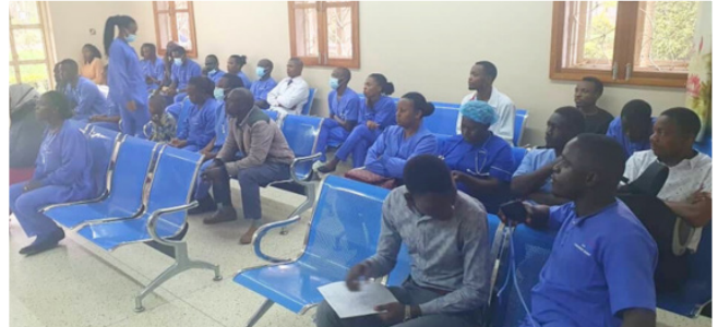
UGANDA VIRTUAL GRAND ROUNDS

These collective efforts reflect CSI's growing role in global surgical education, strengthening local capacity while fostering international academic partnerships.