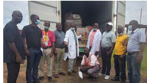
Supplies valued at $40,000 arrived in Liberia in 2021 for our partners at Firestone Duseide Hospital.