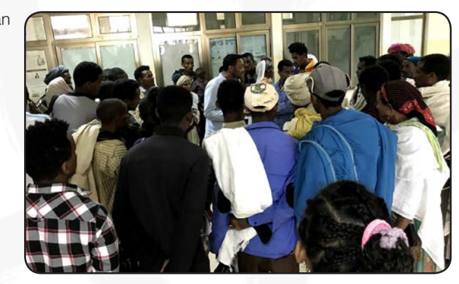
Hoping for help

The baby girl I held in my arms an hour earlier is on that list to return for CSI's next visit in November. I may never see her or her mother again, but I will always remember them and the bond we wordlessly formed. Like that quietly desperate mother, I have hope and faith that CSI and our local partners will be there for them in November, thanks to the support of people like you.