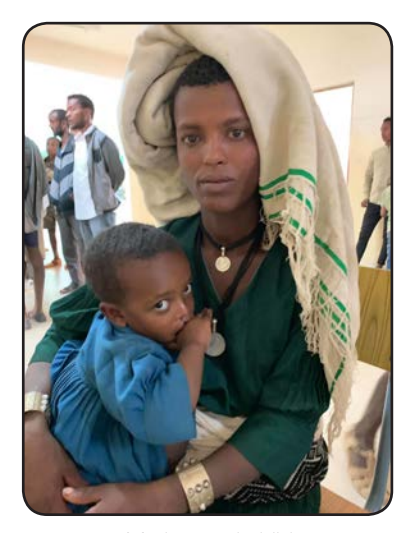
Mother and child