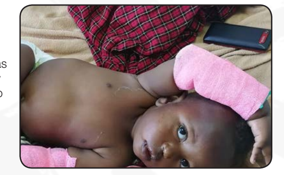
Screening Day in Arusha

Babies Breathe curriculum to fit our time frame - teaching assessment skills, reinforcing their existing knowledge base, and focusing on breath support only if a newborn baby needs it. We