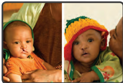
Patient before (left) and after (right) surgery

Our group put me to work on day one. This included my favorite "job," holding the babies after their surgery; I loved every second of it. I was reminded how much I enjoy helping those who can't help themselves, and as cliché as it may be, the trip put perspective back into my life. How often do we allow ourselves to dwell on the truly small problems? The children we work with face unimaginable problems and challenges far beyond their age. On top of the physical and emotional strains of extreme poverty, many also experience harassment from their peers and sometimes even their own parents. If you think they are immune to the effects of bullying, they are not.