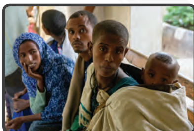
Waiting to be screened

I didn't know what to expect for this trip; I'd never gone on a mission trip to a foreign country, let alone traveled to Africa! I knew no one on the team, and I didn't really know where my place in the group would exist. I was intimidated to be surrounded by these incredibly smart nurses, doctors and surgeons. As it turns out, they were incredibly smart, but, they also all shared this common goal to make the world a little bit better. This immediately broke down any hierarchy I feared and united us as a team.