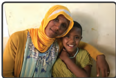
Urology patient and mom