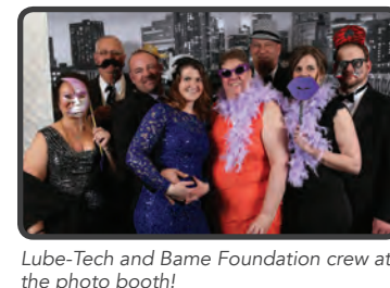
Lube-Tech and Bame Foundation crew at the photo booth!