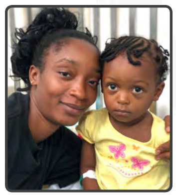
Mother and daughter.

January's trip was a special week. Together, the team of 23 CSI volunteers and dozens of Firestone Liberia staff, completed 101 surgeries and eight complex consults in the areas of ENT, general surgery and urology. As part of our commitment to sustainability, CSI OR volunteers provided hands-on surgical training, and CSI medical volunteers provided 22 hours of education that included CPR and first aid, well-care and bedside nursing training.