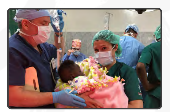
Young patient being carried out of surgery.