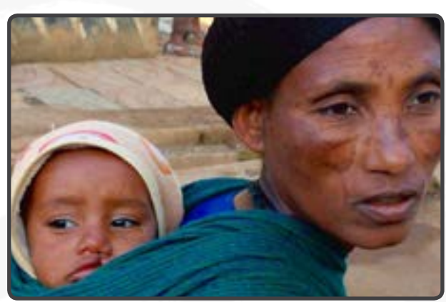
Families travel long distances to receive treatments.