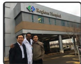
Regions Hospital tour