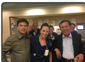
Gillette Children's tour