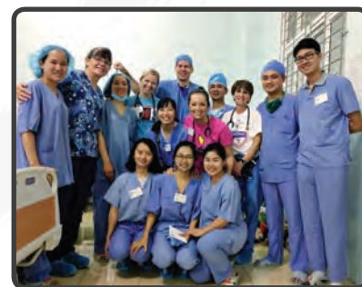
CSI team members and translators