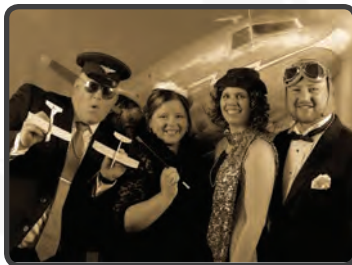
Lubrication Technologies Table