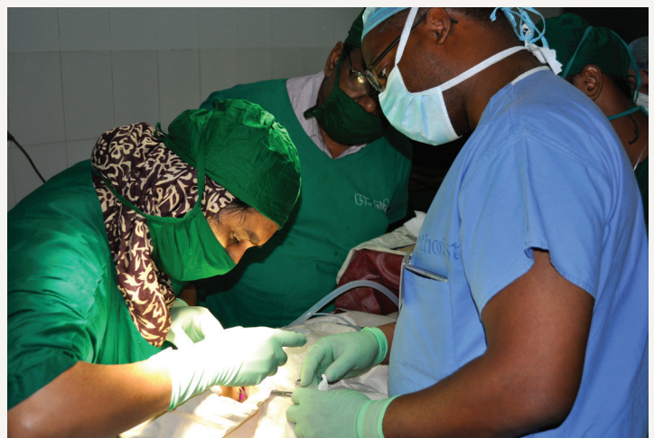
Surgeons at work during the mission.

The three surgeons joining us all specialize in Pediatric Facial Plastic and Reconstructive surgery. Other volunteers include logistics specialists, nurses, anesthesiologists, nurse anesthetists, operating room specialists, biomedical engineer, plus an interpreter. We are so fortunate to have yet another amazing group of volunteers willing to share their time and talents.