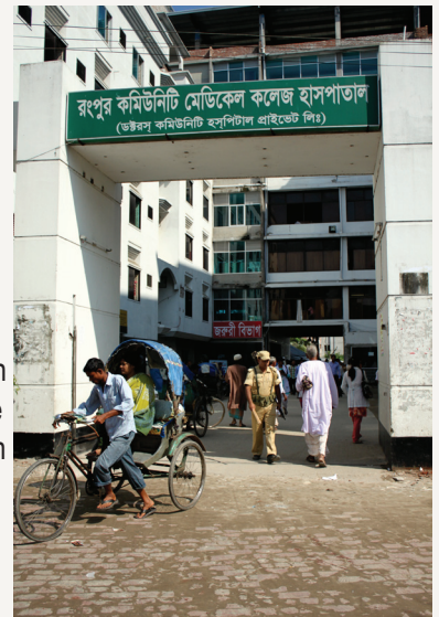
The hospital in Bangladesh.