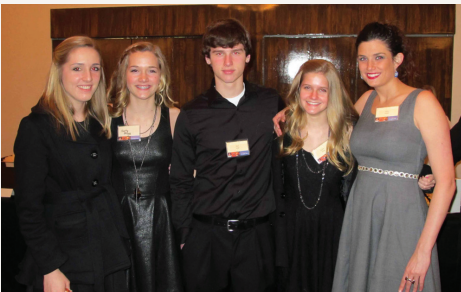
Stege and Koppel Family Volunteers