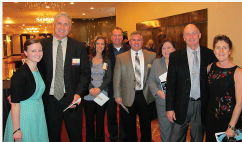
Tradition Capitol Bank