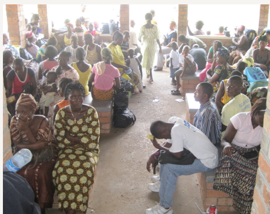
Patients and families waiting to be screened