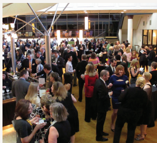
Silent Auction and Cocktails