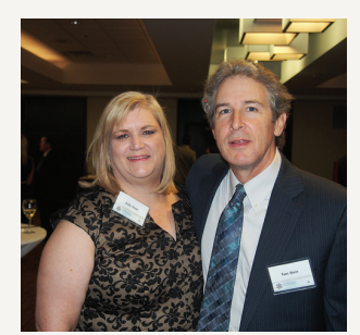
... An event to benefit children around the world