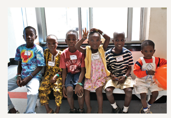
Children from an orphanage near Duside Hospital seeking care during CSI 2013 mission

The tragic events related to the Ebola crisis in Liberia and West Africa are overwhelming. From unprecedented death rates, to profound economic and health effects, to the fear and chaos that have ensued, the impact is staggering.