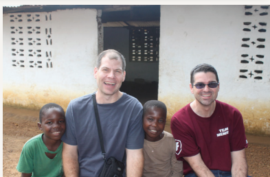
At the orphanage

We formally recognize all individuals who have donated in the last year in our summer newsletter. To donate, please visit our website or contact the office.