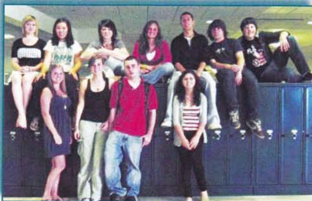
Students at Wayzata High School who were part of the Smiles for Kids Fundraiser in Plymouth