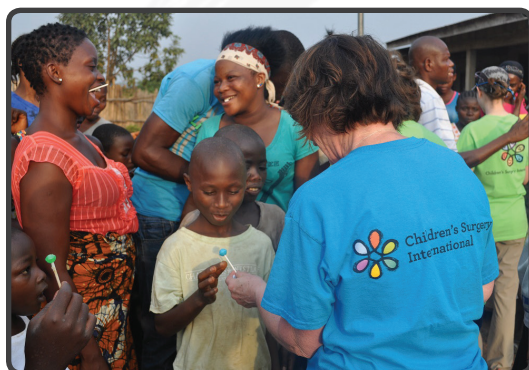
Medication is followed by lollipops at the orphanage.

The busy week ended with a moving closing ceremony, attended by the Liberian Vice President and the U.S. ambassador to Liberia. A Liberian drum and dance group provided entertainment. Expressions of gratitude were shared by members of the CSI team and Liberian hospital and government officials. The team noted it was hard to discern who was more grateful – them or us!