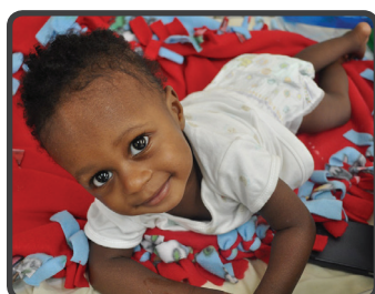
Young patient waiting for surgery.

In addition to working all week at the hospital, many team members chose to use their one rest day participating in a community health initiative. Team members visited Frances Gaskin Orphanage, where they administered anti-parasitic (deworming) to 75 children. Parasitic infections are among the most common infections in developing countries, significantly impairing nutrition, which of course can lead to many other health problems. Thanks to our relationship with Orphan Relief and Rescue, we were able to return to the orphanage again this year. The team also visited the village of Cotton-Tree at the request of the village